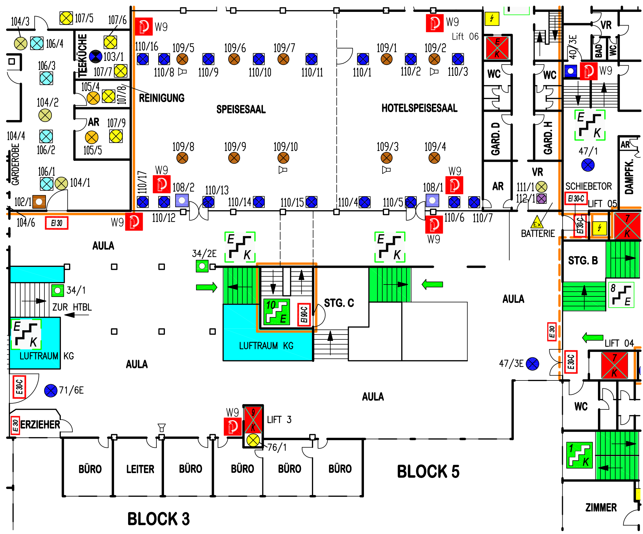
Plan Nr. 9